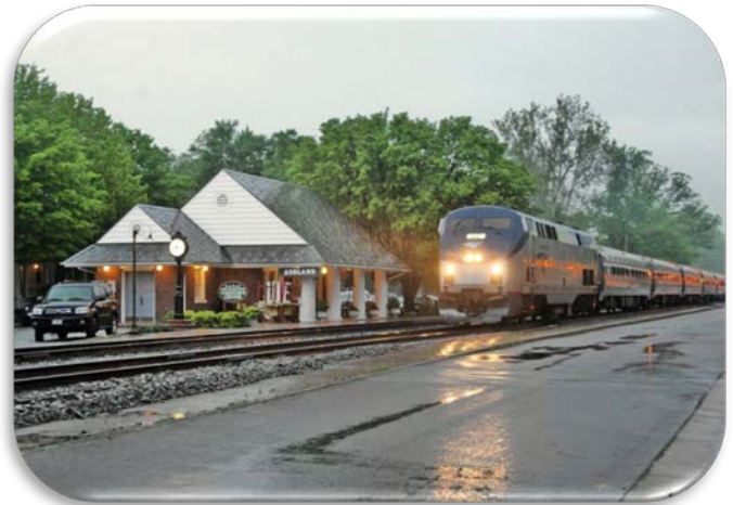
Train Depot. Ashland’s 1920s train depot now serves as the Town’s visitor center. Or, you can board a train and head up the East Coast.

Ashland is located 15 miles north of Richmond. Originally developed by the Richmond Fredericksburg and Potomac (RF&P) Railroad Company as a mineral springs resort in the 1840s, it still retains its small town character today. The downtown area revolves around the railroad track, and it is the only Town where you can still board a train on Main Street and travel up the East Coast. The 7.2 square mile area is home to over 7,000 people and serves as part-time residence to the students of Randolph–Macon College.