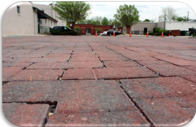
Permeable Pavement. The parking lot's pavers have small gaps between them that allow water to infiltrate below.

community members agreed that retrofitting the parking lot would provide an excellent opportunity for the Town to promote more sustainable stormwater runoff methods. In 2011, the Town Council began to set aside money from its capital improvement fund, and in 2012, the Town was awarded a $25,000 G3 grant to prepare a design.