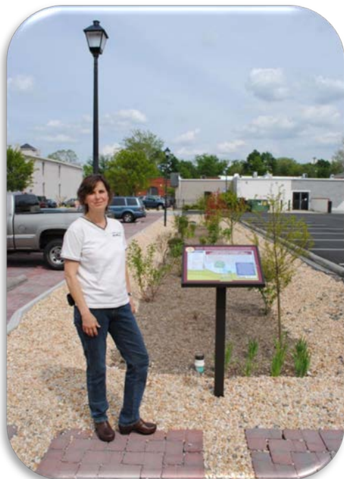
The Retrofit: Ashland’s Town Engineer stands in the parking lot’s new bioretention island. The section at right remains as an asphalt lot.

In 2012, the Town of Ashland received a $25,000 Green Streets, Green Jobs, and Green Towns (G3) grant to co-fund the design and reconstruction of part of an existing municipal parking lot into a “green,” low-impact parking lot. The newly reconstructed lot is one