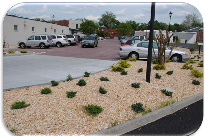
Multipurpose Lot. The multifunctional municipal parking lot demonstrates that stormwater management can be attractive and functional.

Ashland’s Town Hall is located downtown in walking distance to the Town’s historic train station. The Town Hall municipal parking lot serves as a multi-functional space for residents and visitors. In 2010, much of it was torn up for subsurface utility repairs. Town officials and